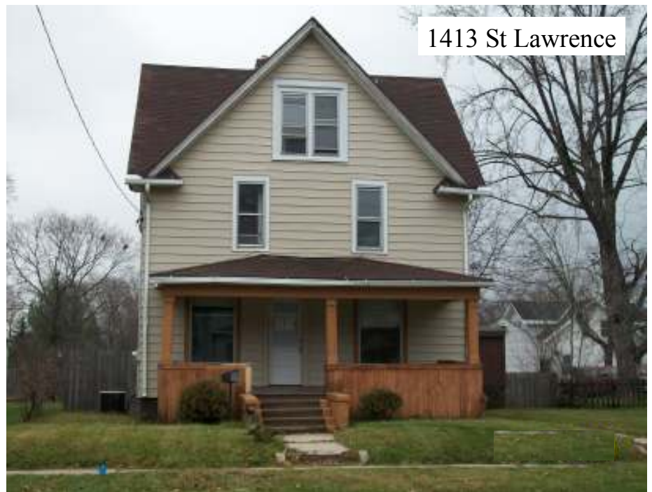
1413 St Lawrence

NHS is also in the process of developing two new single-family homes on Parker Court. Watch for updates on the availability of these properties